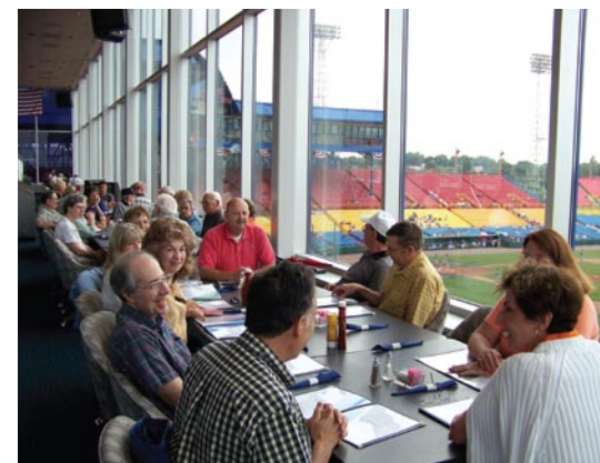
The entire group enjoyed a terrific view of the game from the indoor Stadium Club seating.