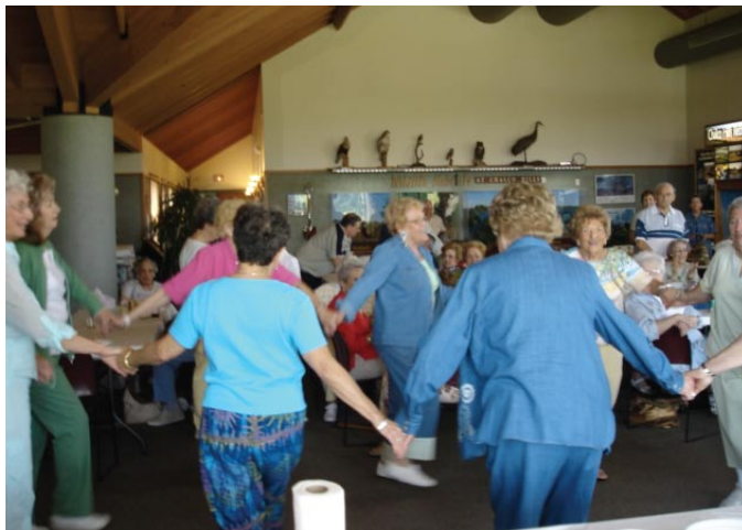
The group celebrated a great year at the VISIONS summer picnic at Chalco Hills Recreation Area.

First up to bat was an outing to Rosenblatt Stadium where members of VISIONS joined the group '39 Forever' for a joint function. The crowd gathered at the Stadium Club for dinner and drinks before the game and enjoyed the action from an excellent vantage point! The Omaha